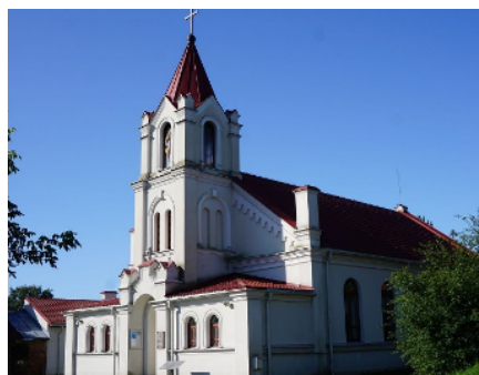
The Kaunas Methodist Church Kaunas, Lithuania

A prayer that Methodists in Kaunas are praying during the month of May: Come, Holy Spirit. Fill our hearts. Help us to see You more clearly, to experience your work in our lives. Merciful God, fill us with the gifts of Your Spirit. Lead us and strengthen us each day. In the name of Jesus Christ, our Lord, Amen.